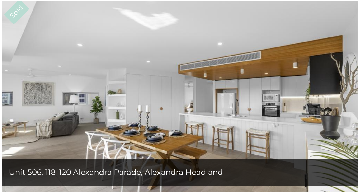
Unit 506, 118-120 Alexandra Parade, Alexandra Headland