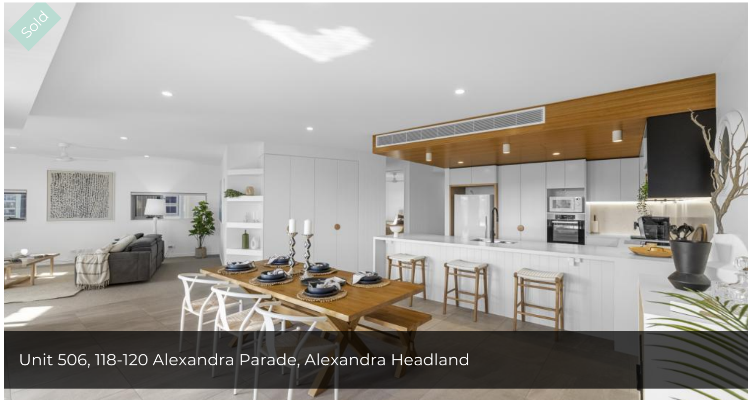
Unit 506, 118-120 Alexandra Parade, Alexandra Headland