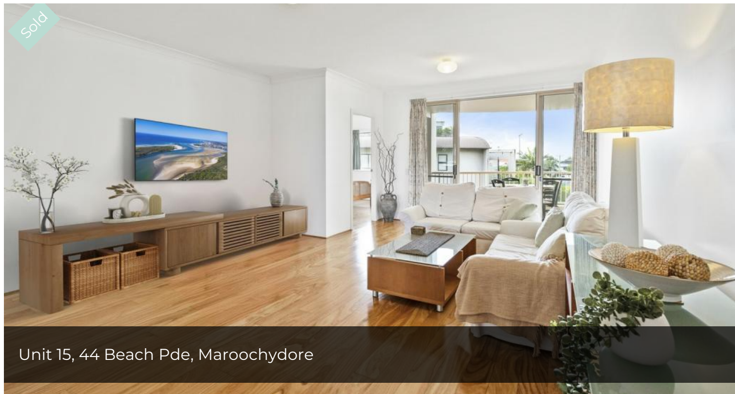
Unit 15, 44 Beach Pde, Maroochydore