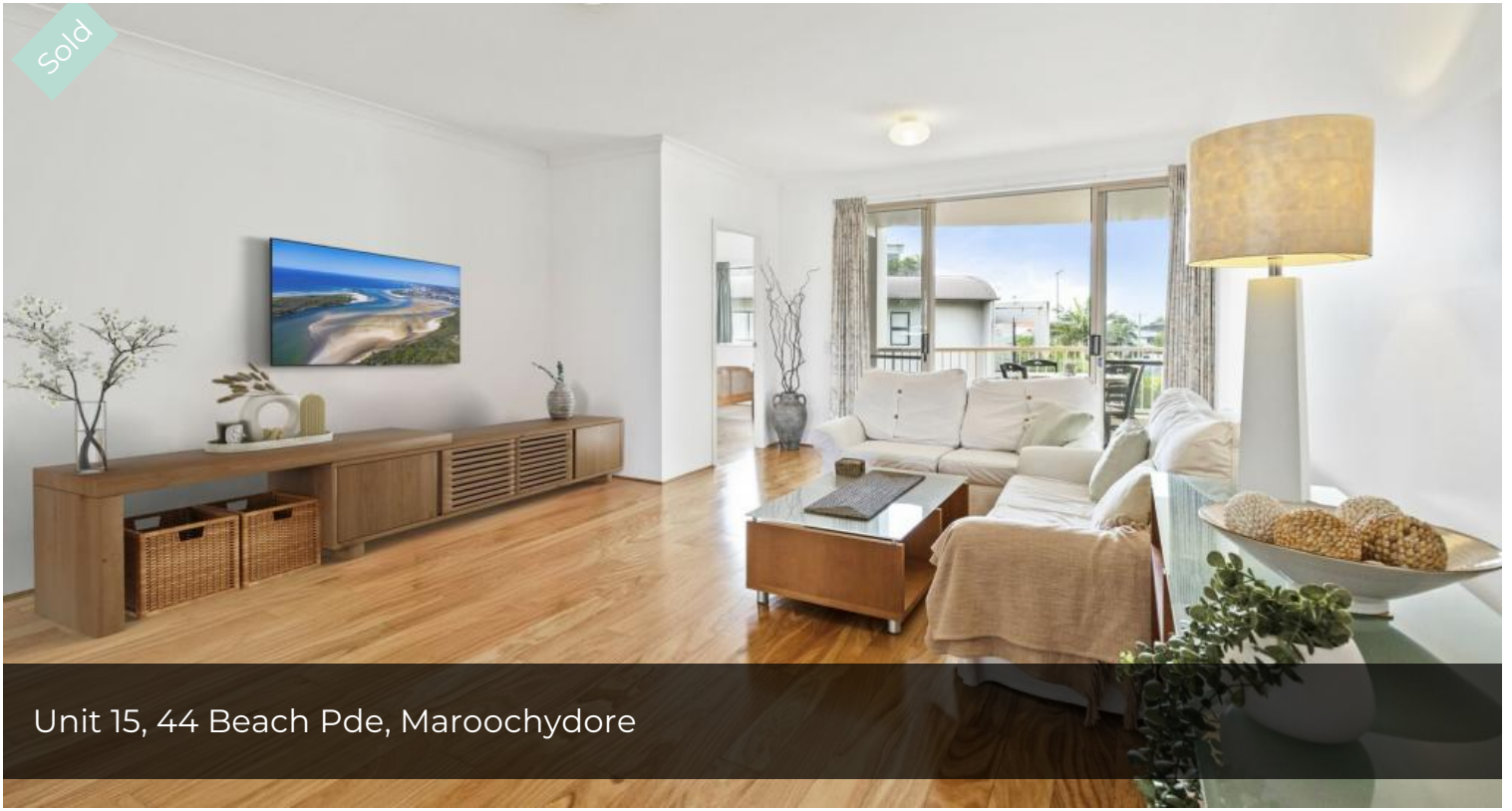
Unit 15, 44 Beach Pde, Maroochydore