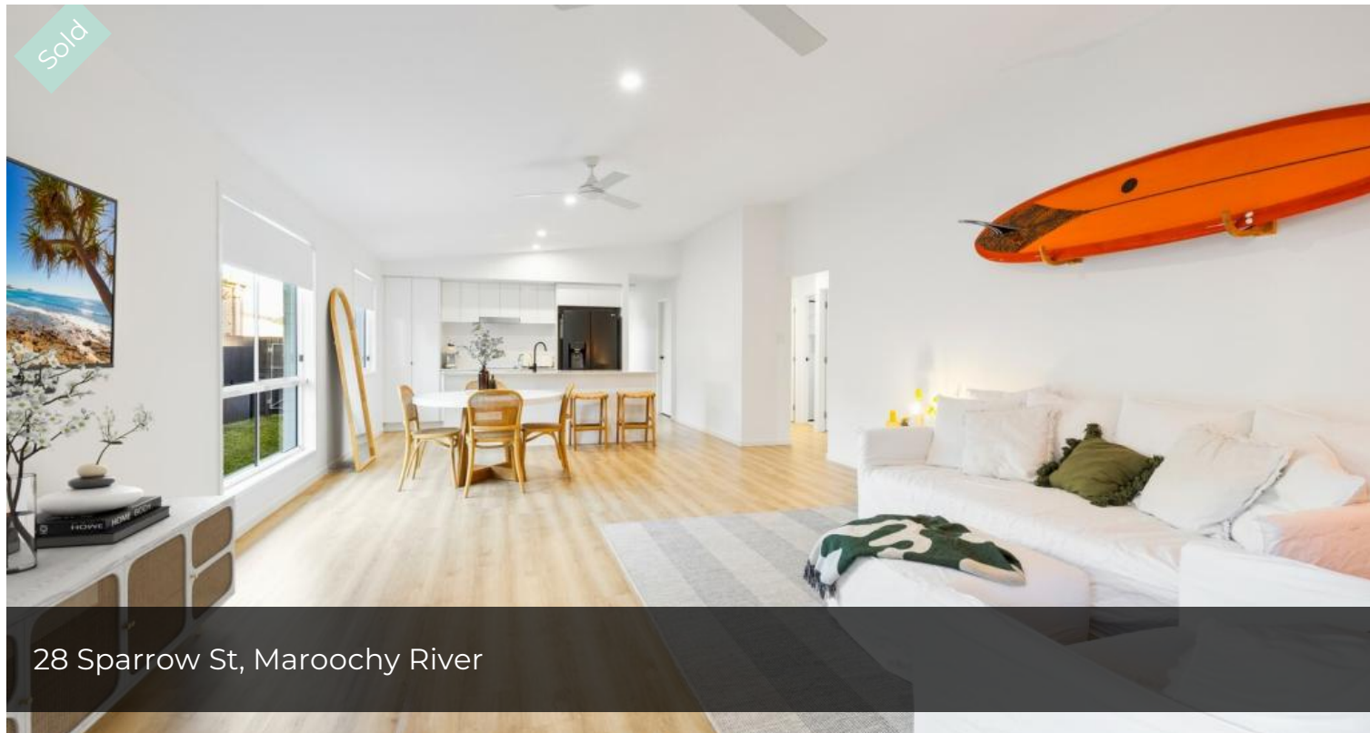
28 Sparrow St, Maroochy River