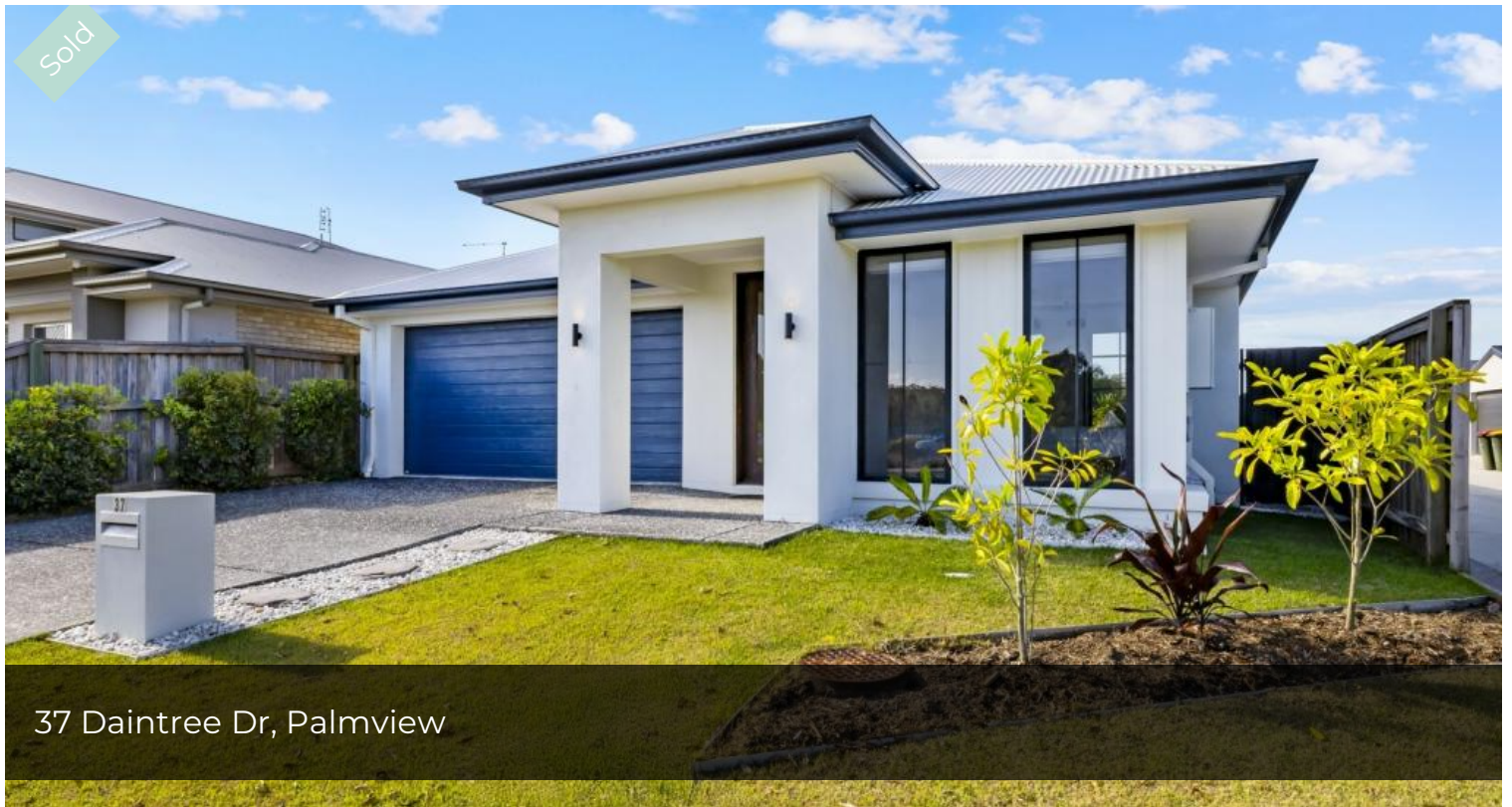
37 Daintree Dr, Palmview