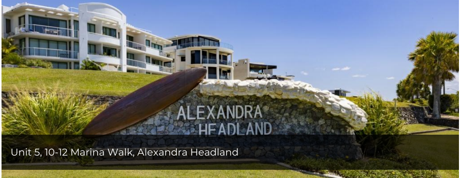
Unit 5, 10-12 Marina Walk, Alexandra Headland