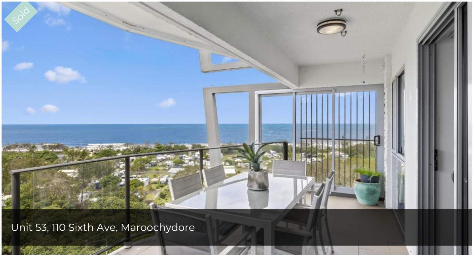
Unit 53, 110 Sixth Ave, Maroochydore