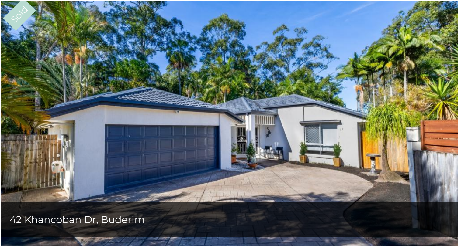
42 Khancoban Dr, Buderim