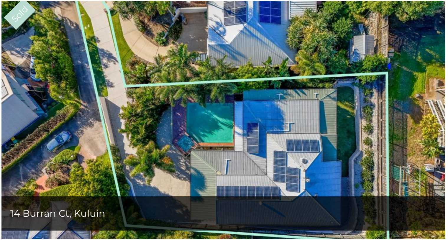
14 Burran Ct, Kuluin