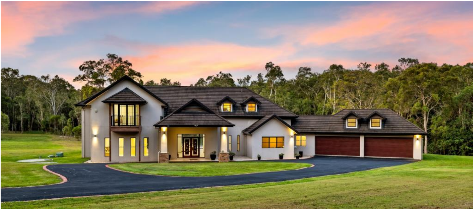
85 Arcoona Rd, Coolum Beach