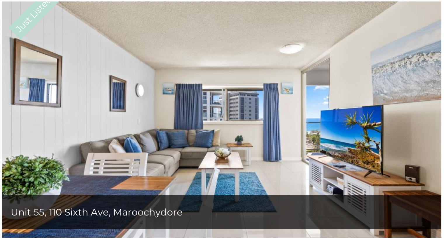
Unit 55, 110 Sixth Ave, Maroochydore