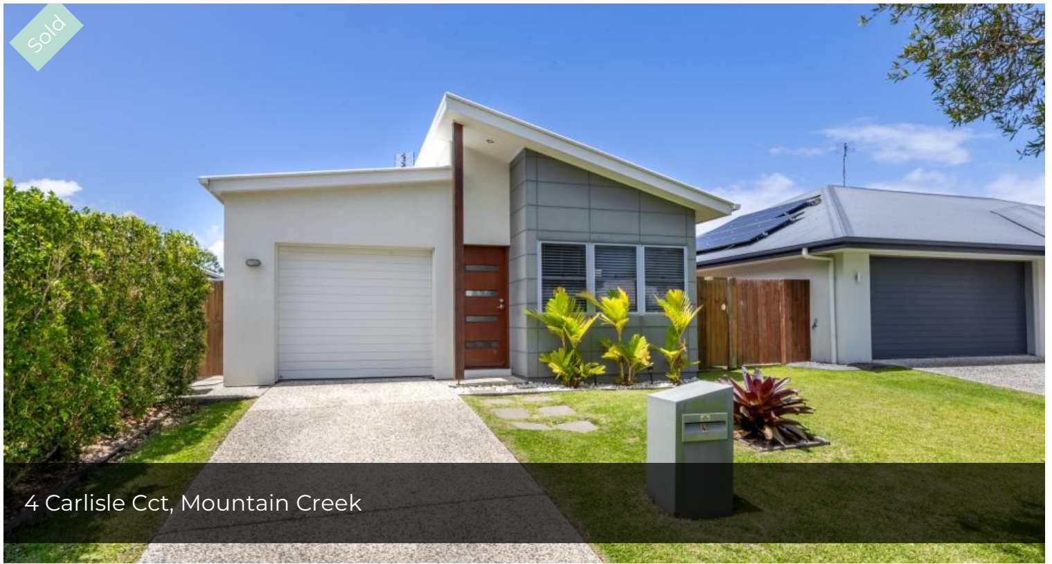
4 Carlisle Cct, Mountain Creek