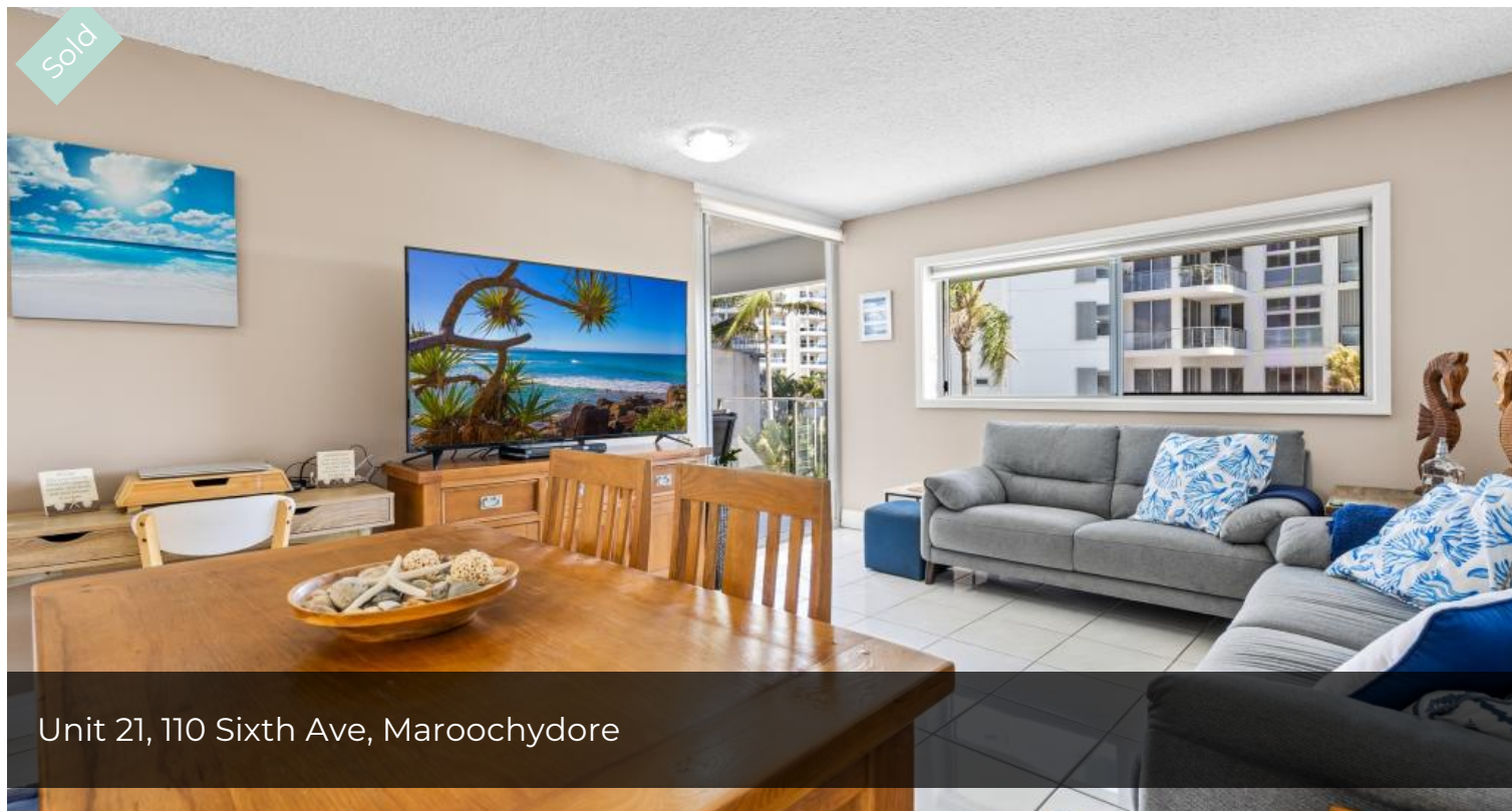
Unit 21, 110 Sixth Ave, Maroochydore