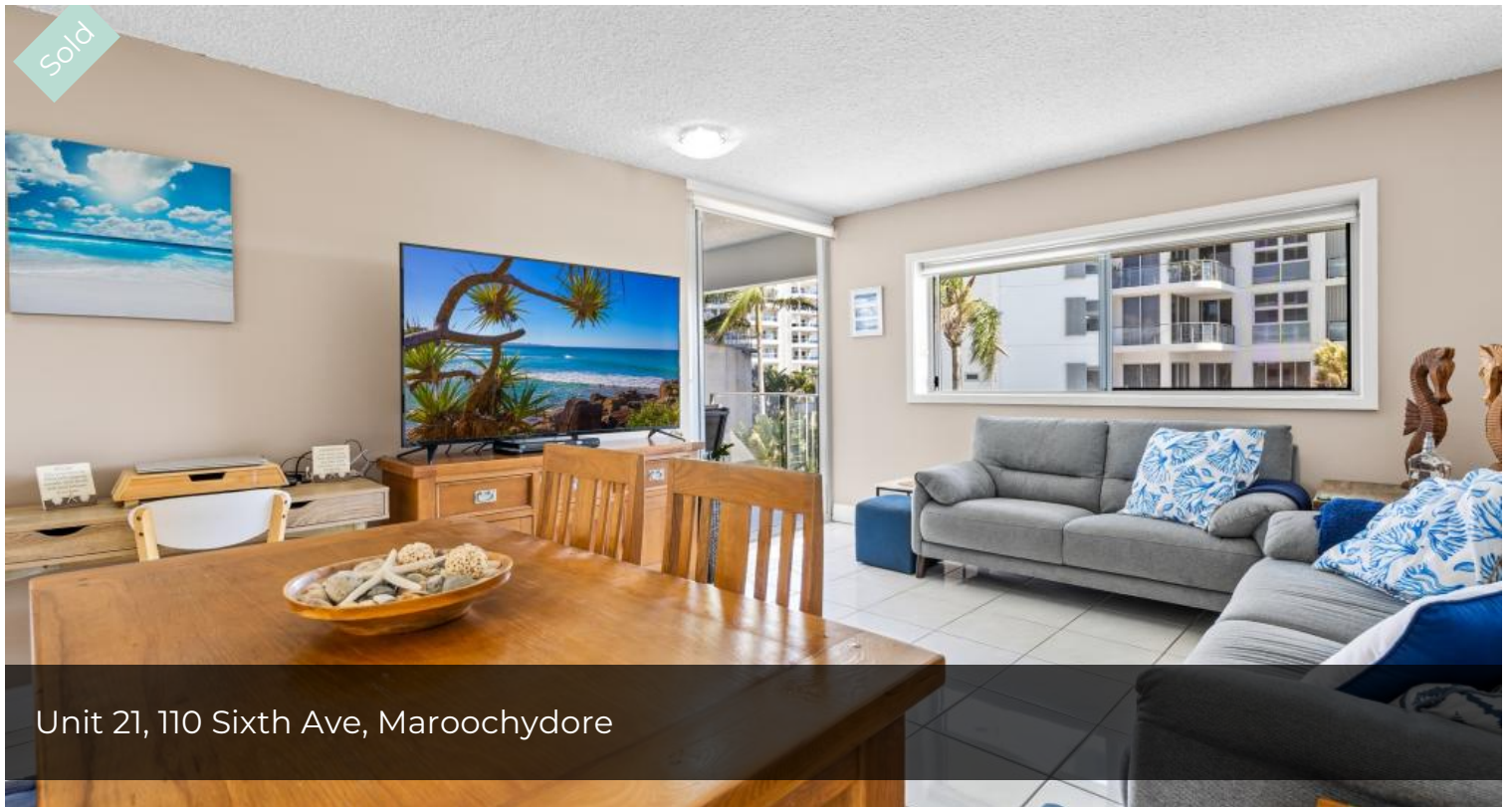
Unit 21, 110 Sixth Ave, Maroochydore