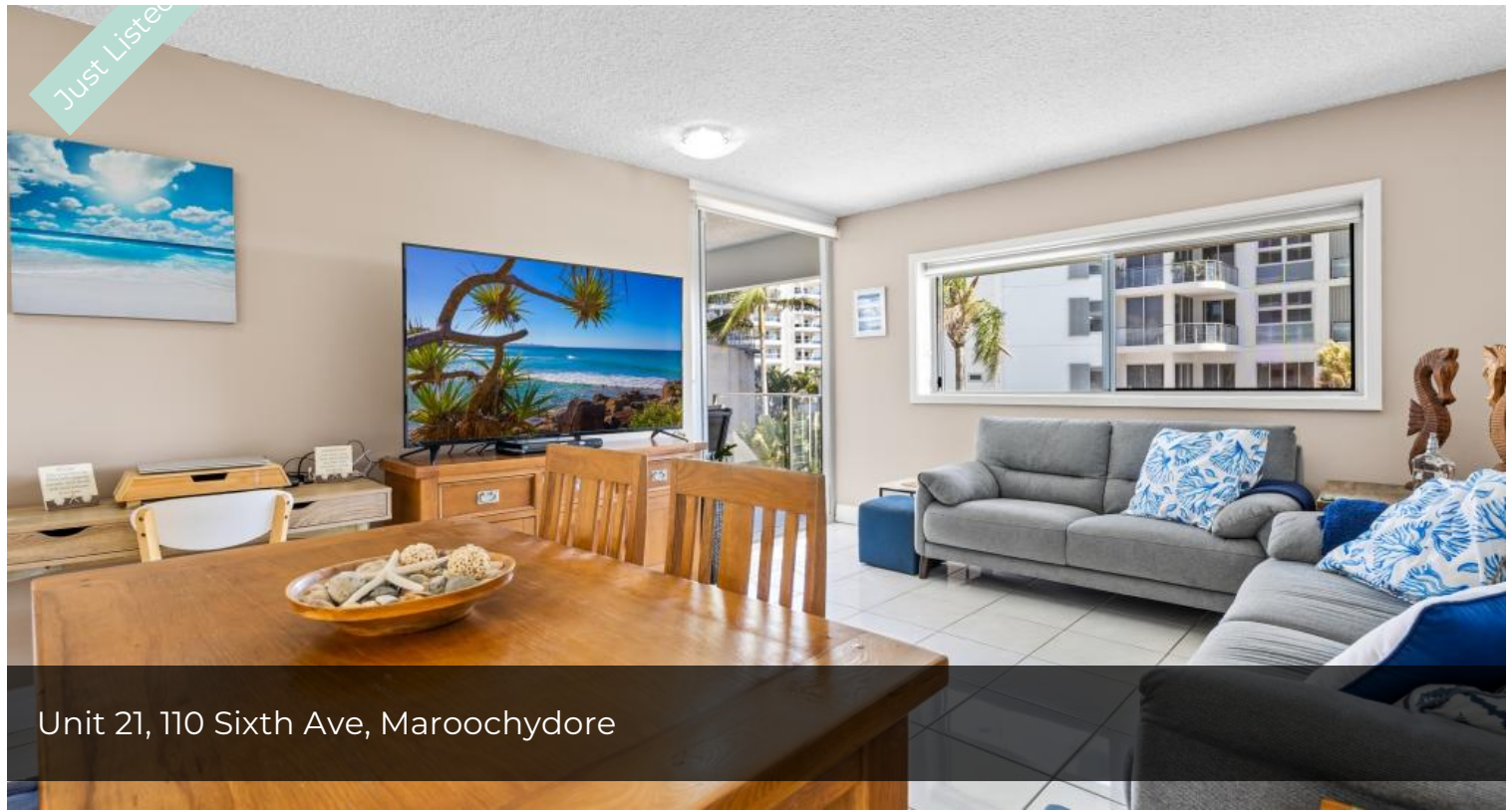
Unit 21, 110 Sixth Ave, Maroochydore