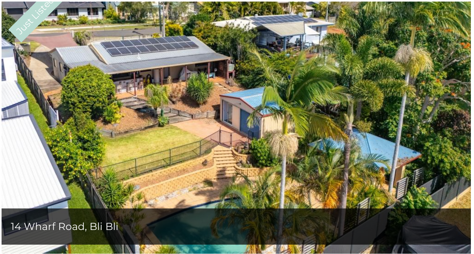
14 Wharf Road, Bli Bli