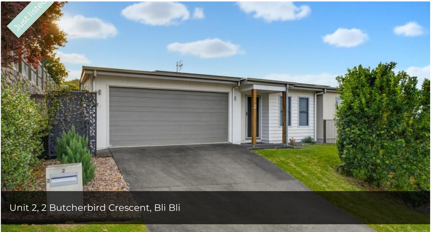
Unit 2, 2 Butcherbird Crescent, Bli Bli