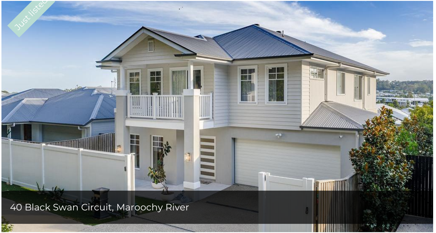
40 Black Swan Circuit, Maroochy River